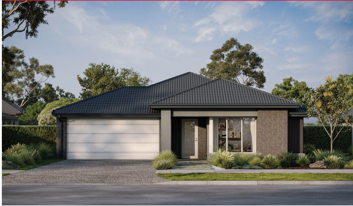
HARDY 26 | ELEVATE RANGE