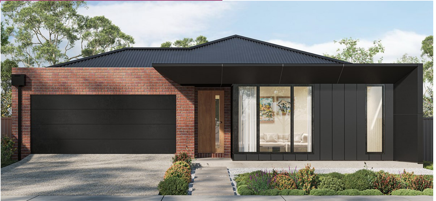
Image & façade shown for illustrative purposes